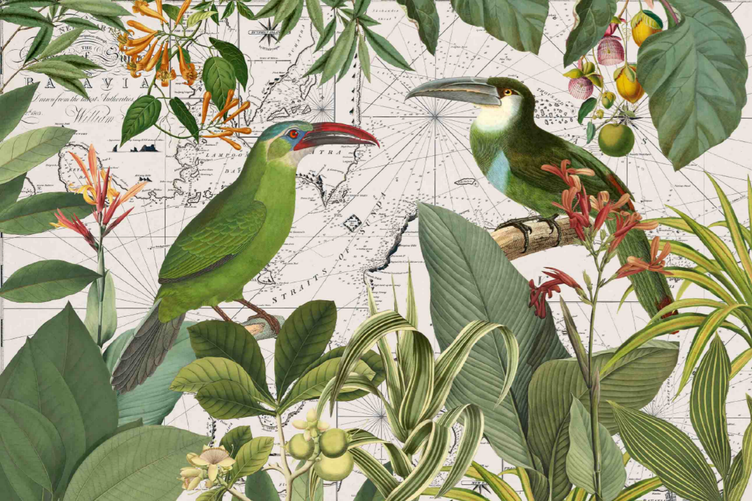
1 122094 Green Nostalgic Tropical Birds