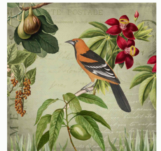
6 122093 Tangerine Vintage Bird