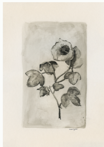
3 133040 Vintage Flower III