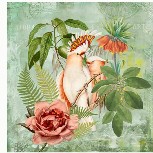
1 122192 Tropical Paradise Cockatoos Bird