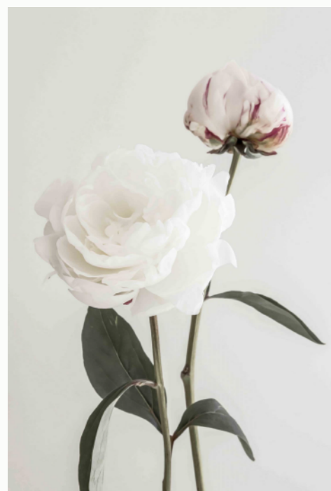
1 122188 Romantic Blur Peony III