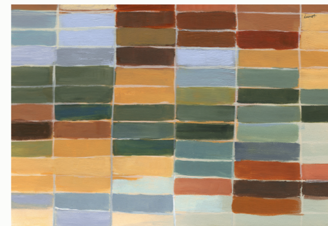
4 134415 Color Grid III