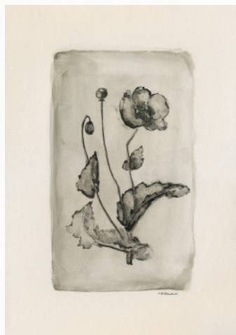
1 133038 Vintage Flower I

The once-muted landscapes of browns and grays were now awakening, giving way to the vibrant hues of a blooming spring. Eager to capture this metamorphosis, we embarked on a journey to create a collection that would encapsulate the essence of change.