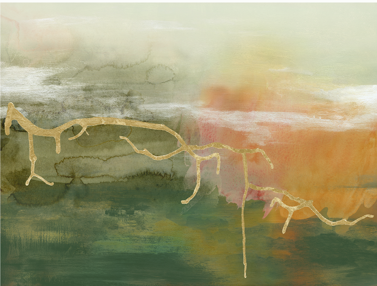
2 134433 Breathing Greenery I