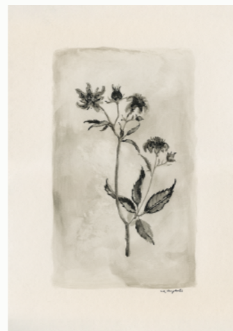
4 133041 Vintage Flower IV