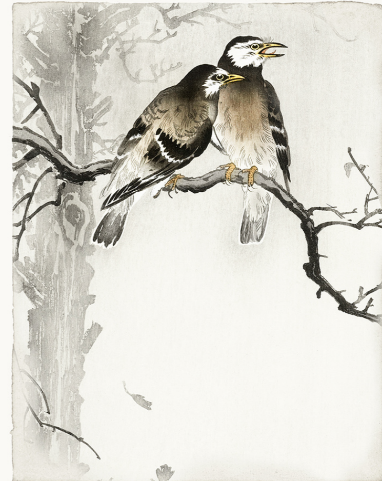
TWO GRAY STARLINGS (1900 - 1936)