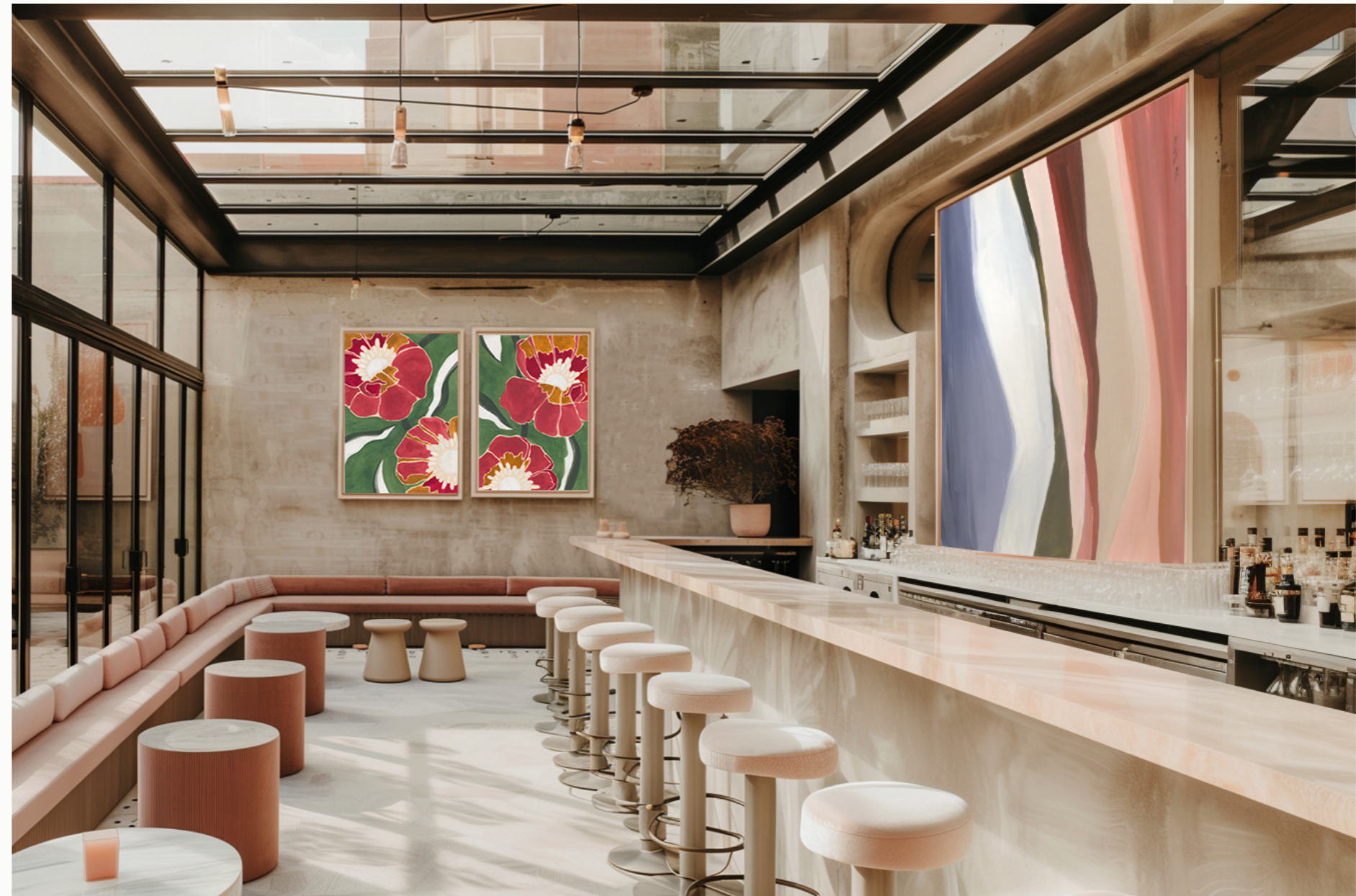
1 134421 Cerise Floral Dream I

Delicate petals intertwine, creating a harmonious composition that is both bold and delicate, much like the arrival of spring itself.