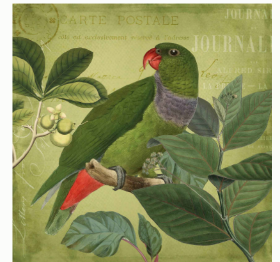
4 122209 Vintage Tropical Birds II