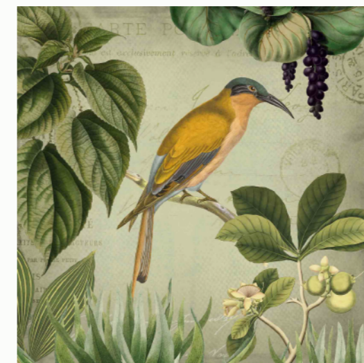
5 122097 Yellow Nostalgic Tropical Birds