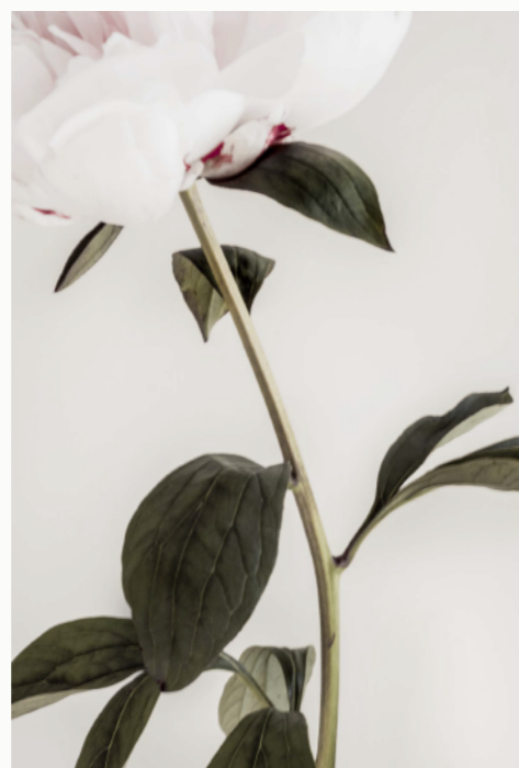
2 122189 Romantic Blur Peony II