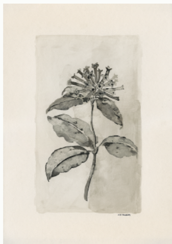
2 133039 Vintage Flower II