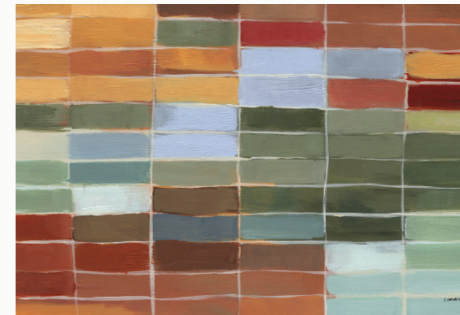
2 134414 Color Grid I