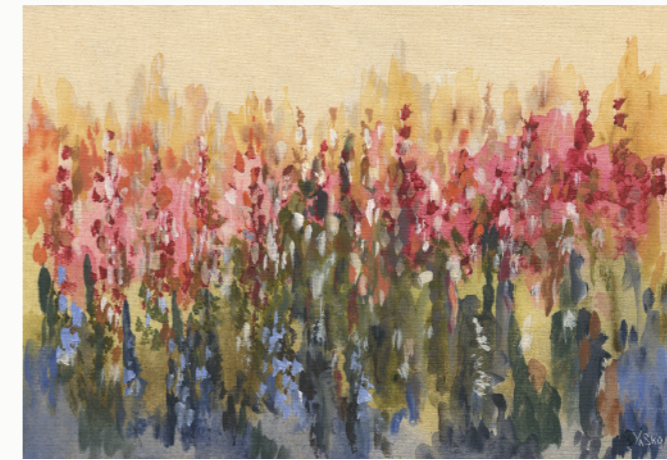
1 134430 Floral Memories