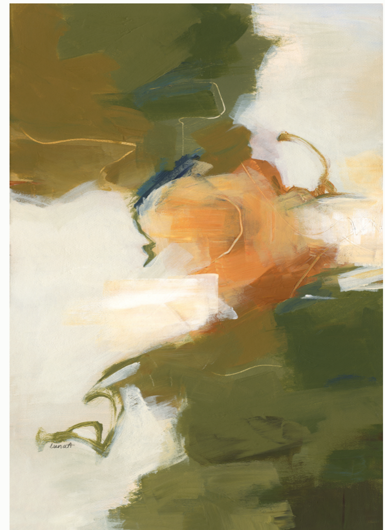
3 134416 Breathing Greenery II

As we want to capture the essence of these exotic landscapes, the prints promised to transport viewers to faraway paradises, sparking the imagination and infusing homes with the warmth of tropical sunsets and the rhythm of swaying palms.