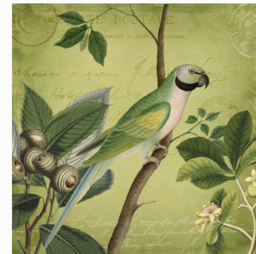
3 122208 Vintage Tropical Birds I